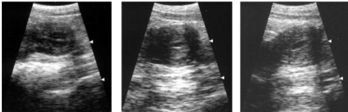
Figure 1. Ultrasonographic images of non-pregnant (A) and pregnant uterus on day 12 (B) and day 15 (C) after ovulation.

smears did not exhibit eosinophilic cells during the advanced follicular phase.